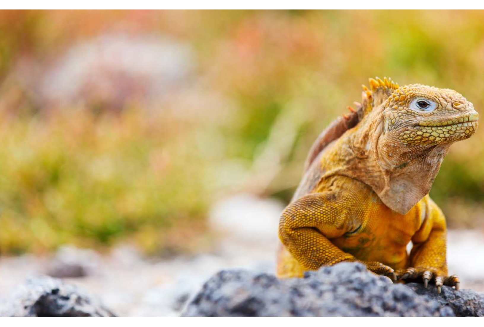
August 17 - 25, 2019