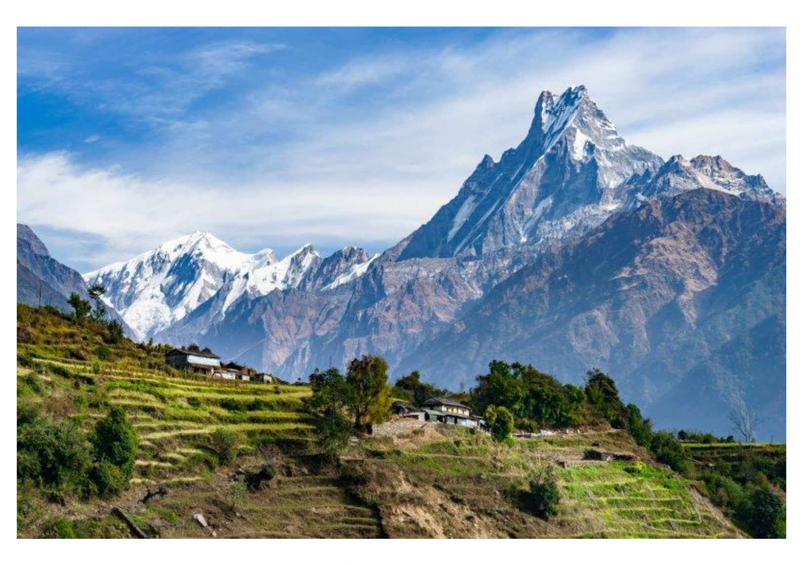
October 18 - 31, 2024