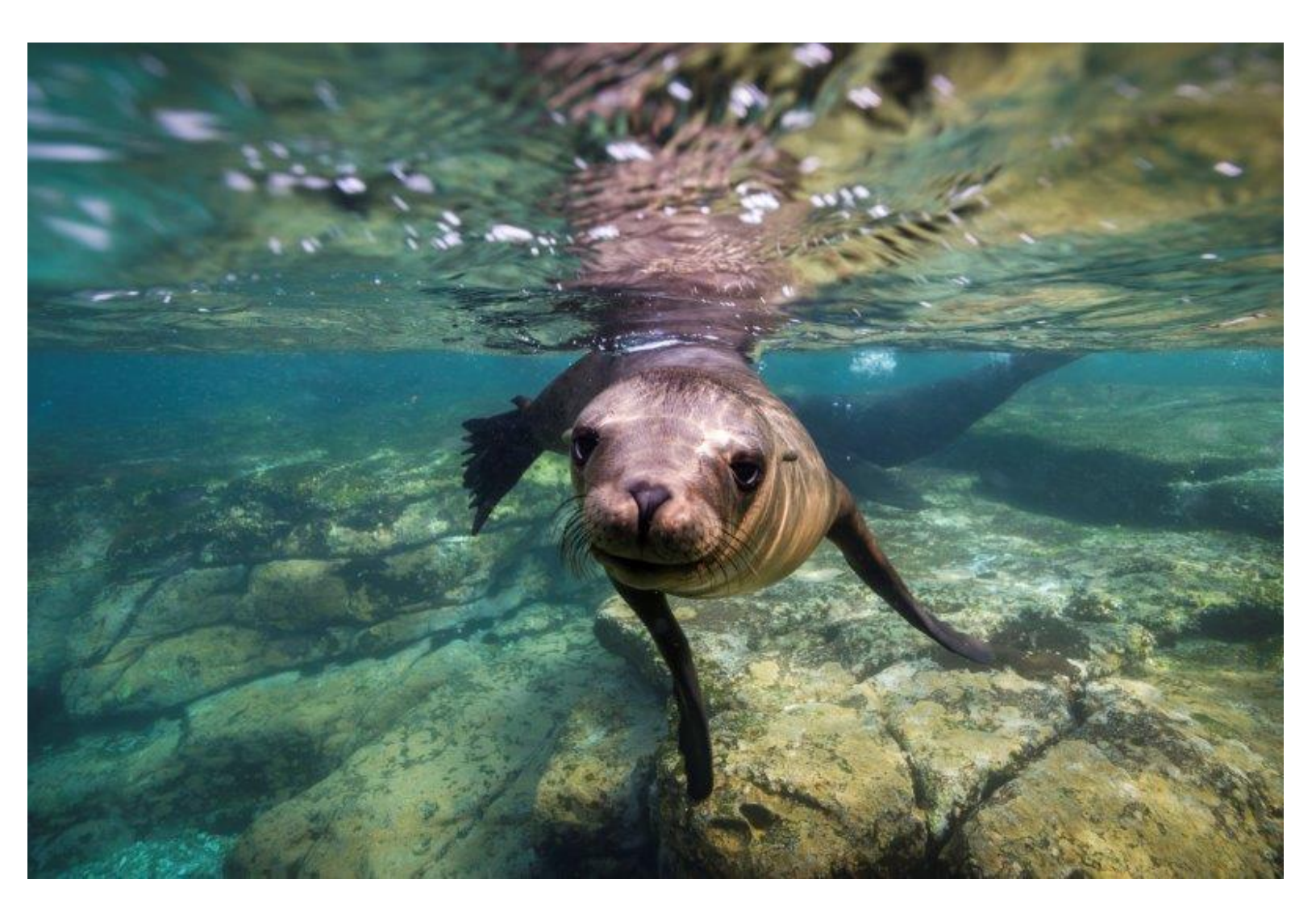
April 6 - 12, 2024