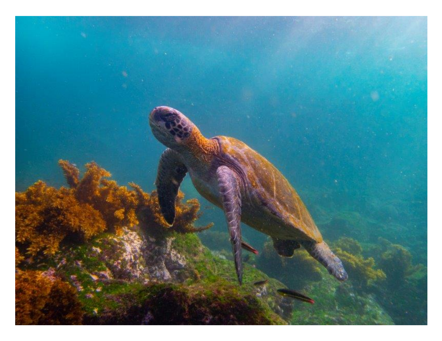
August 10 - 18, 2024