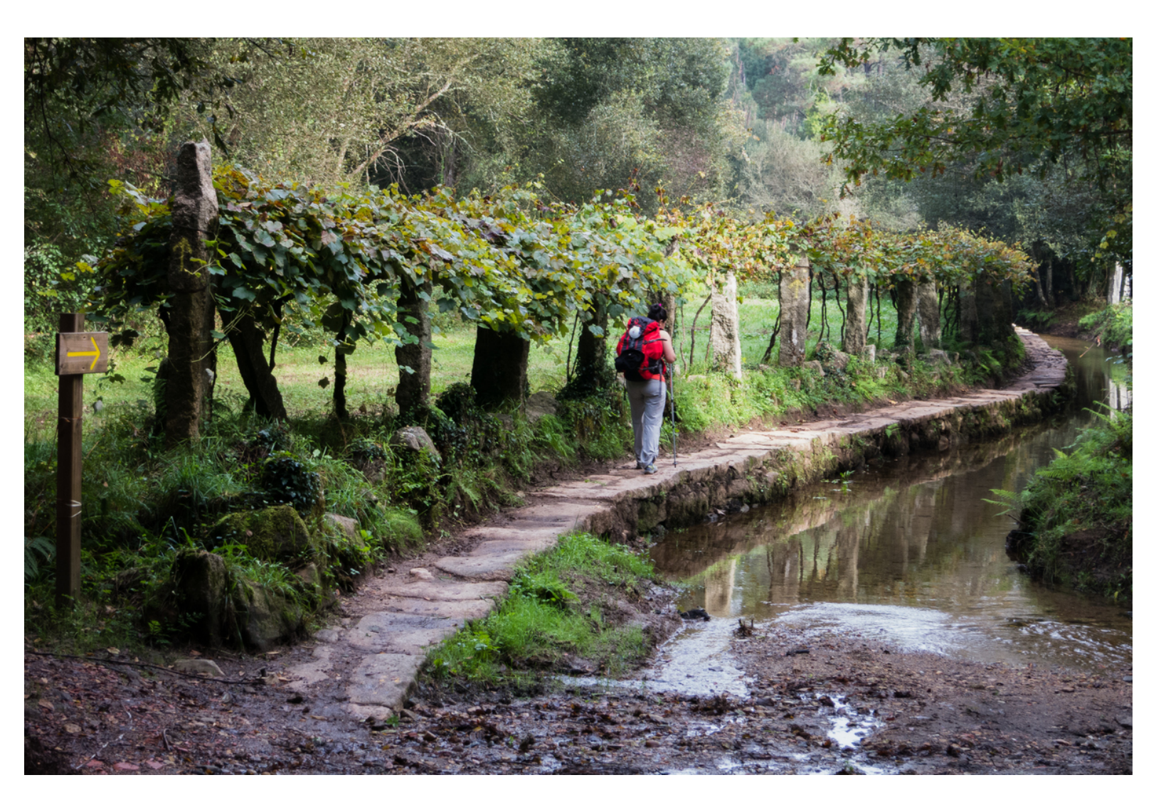
May 4 - 12, 2024