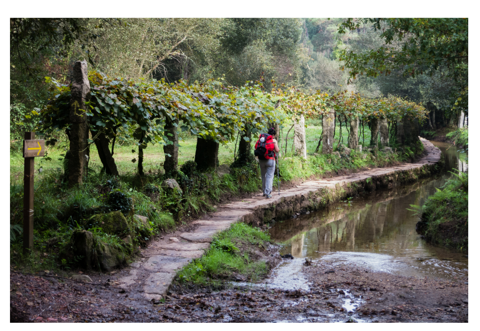
September 7 - 15, 2024