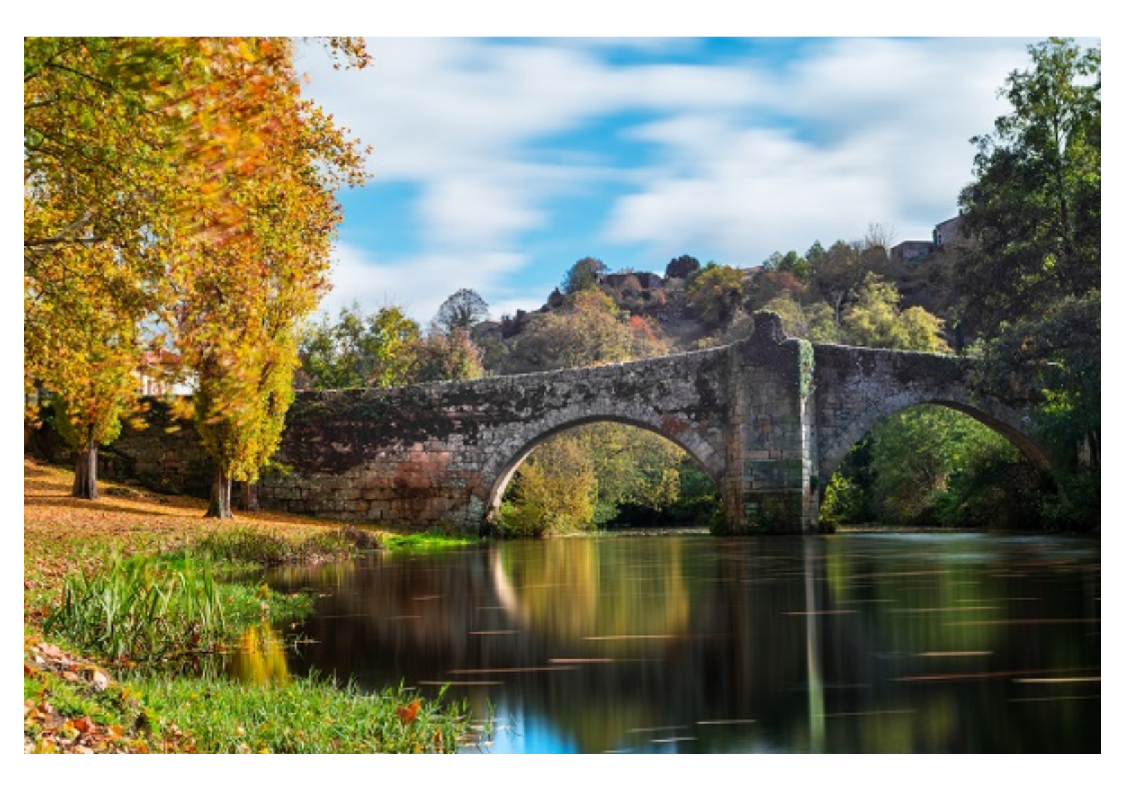
September 13 - 21, 2024