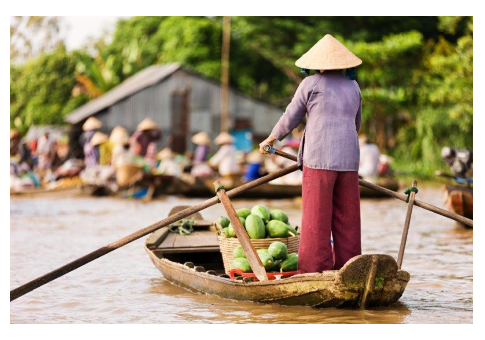
November 7 - 17, 2024