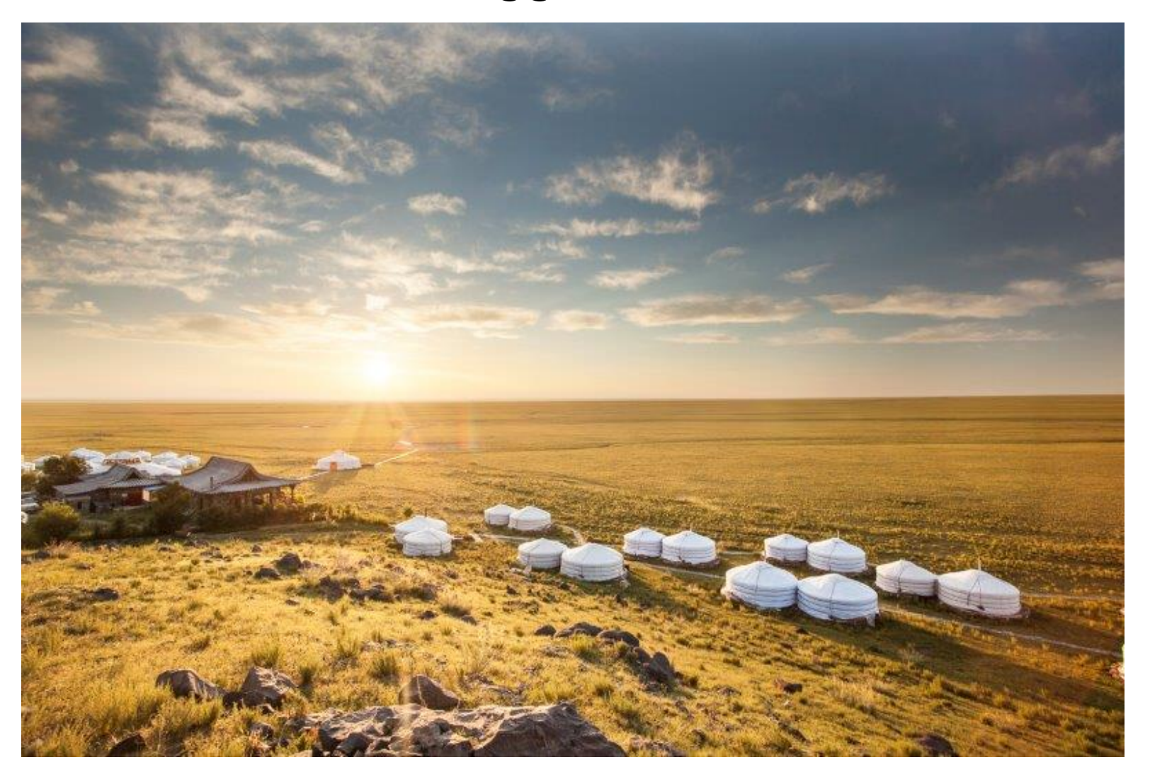
June 15 - 25, 2025