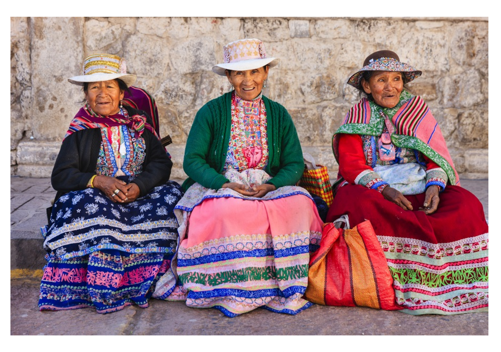
June 4 - 14, 2025