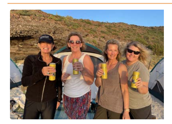
Day 7 Depart Todos Santo

After a fond farewell and breakfast, say "hasta luego" to your guide and new friends! Depart from San Jose del Cabo Airport (SJD) today after 12:00 PM.