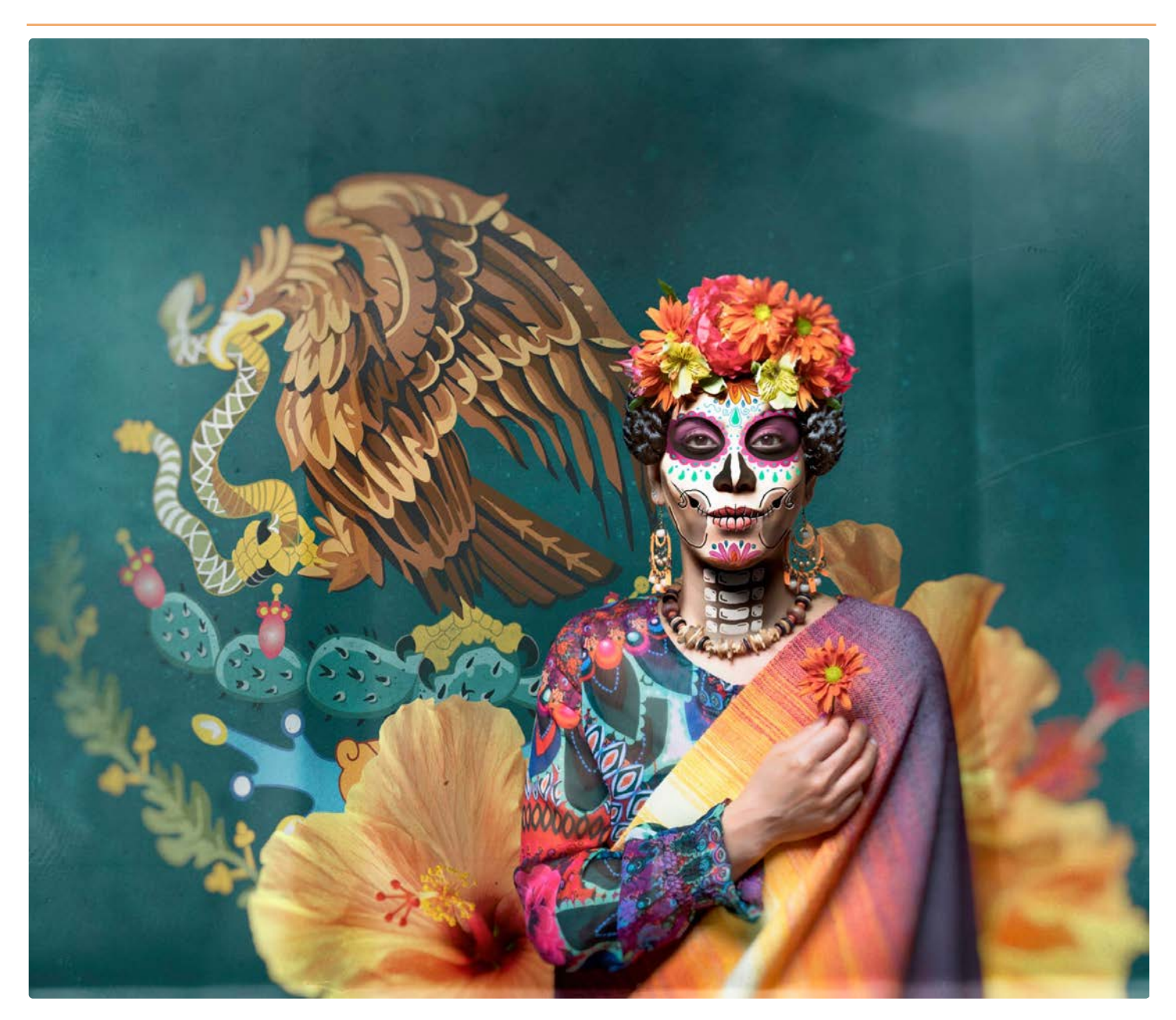
Baja: Day of the Dead Adventure