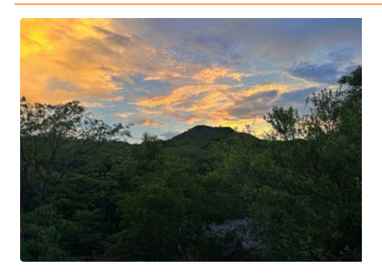
Day 7 Arenal to Guanacaste

After breakfast, head to the Guanacaste region in the northwestern province in Costa Rica. Arrive at Rio Perdido, your home for the next 3 nights, and spend some time relaxing and soaking in the surroundings. Enjoy an afternoon at leisure before joining your group for a delicious dinner.