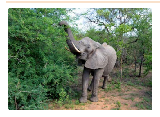
Day 3 Ngala Safari Lodge

Enjoy your first day at Ngala Safari Lodge, where each day begins and ends with thrilling safari adventures. Embark on scheduled game drives and bush walks led by expert guides, encountering the Big Five and other incredible wildlife in their natural habitat. Between game drives, relax and enjoy the lodge's serene amenities. For a unique adventure, the optional Treehouse Experience offers an unforgettable night under the African sky. All meals, refreshments, and drinks are thoughtfully prepared and included, ensuring a delightful culinary experience to complement your safari activities.