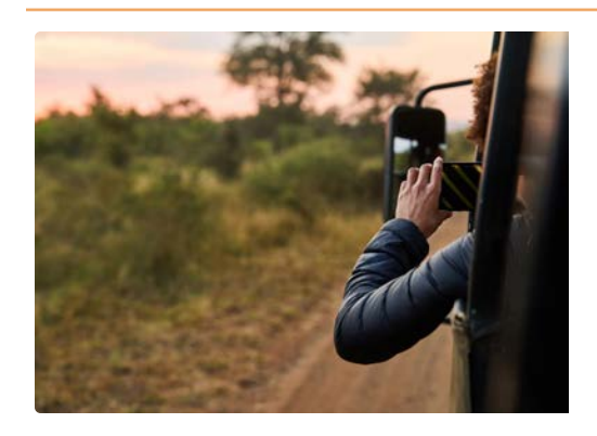
Day 7 Celebrate An Amazing Journey

Another magnificent day of exploration awaits, with expertly guided day and night safaris to encounter the Big Five and other remarkable wildlife in their natural surroundings. Participate in guided bush walks to explore the African wilderness on foot, discovering hidden flora and fauna. Enjoy a farewell dinner with your new AdventureWomen friends, reflecting on cherished memories and celebrating an amazing journey through this remarkable country.